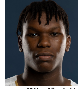
Fr. // F // 6-8 Orlando, FL