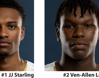
Orlando Christian Prep