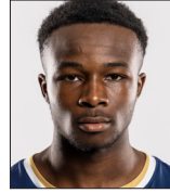
#9 Eno Nto So. • F • Derby, England