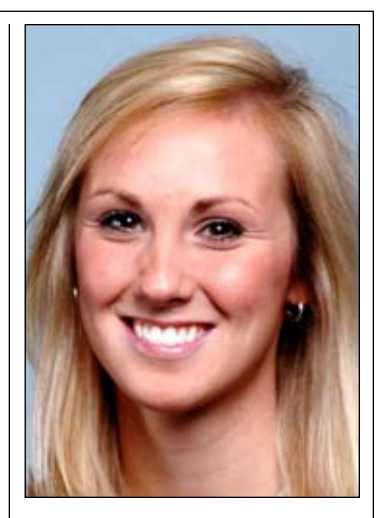
Career Highs Points Career....3, twice (MR: vs. Michigan, 12/2/07)

Rebounds Career....2, three times (MR: vs. St. Francis, 12/29/07)