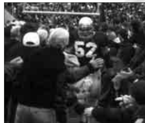
Monogram Club members annually greet the Notre Dame football team as it takes the field prior to the final home game.

• The organization of several popular events, including the third annual Football Fantasy Camp, the second Adult Tennis Camp and the annual Monogram Club golf outing (held during reunion weekend)