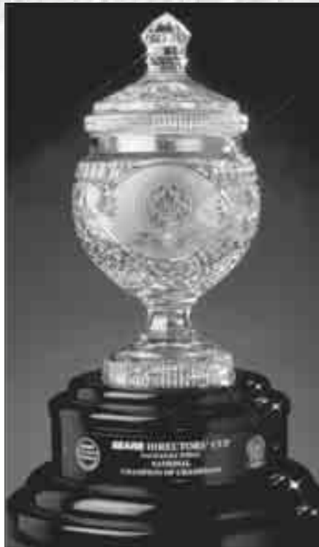
Notre Dame placed 16th in the 2004-05 NACDA Directors' Cup competition.