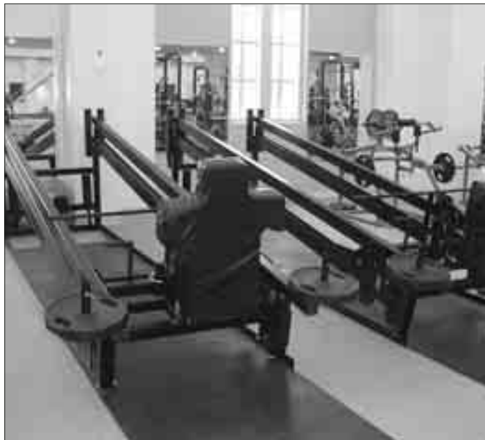
One of the eye-catching features of the Haggar Fitness Complex, a 25,000 square foot facility shared by the Guglielmino Athletics Complex and the Loftus Center, are two variable weight sleds installed in the summer of 2005.

When entering the Haggar Fitness Complex (shared by the Loftus Sports Center and the Guglielmino Athletics Complex) student-athletes are quickly reminded of the "roll-up-your-sleeves" and "get-to-work" mentality that Mendoza and his staff inspires.