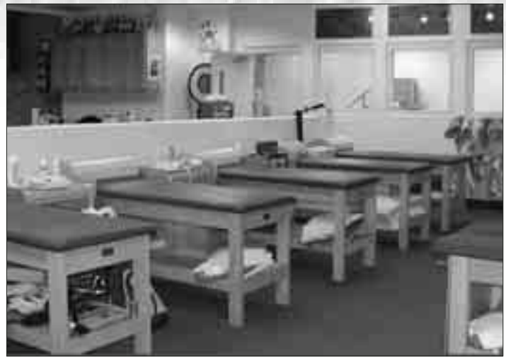
Irish athletics receive the finest in sports medicine care from the team of athletic trainers and physicians.

The Notre Dame student-athlete has access to three state-of-the-art sports-medicine facilities, in addition to the 24-hour University Health Center. The original athletic-training room is located in the Joyce Center. Notre Dame Football Stadium is home to the 3,300-square-foot athletic training room, and the newest addition to the sports-medicine department is located in the new Guglielmino Athletics Center. The facility opened in August of 2005 and is more than 8,500 square feet of cutting-edge sports-medicine technology. Through these facilities all student-athletes have access to the most-modern sports medicine, including the latest in physical therapy modalities and rehabilitation equipment, which includes two 3,500-gallon therapy pools. A full x-ray unit and an MRI machine make up the majority of the department's diagnostic equipment.