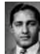
Jose Napoleon Duarte