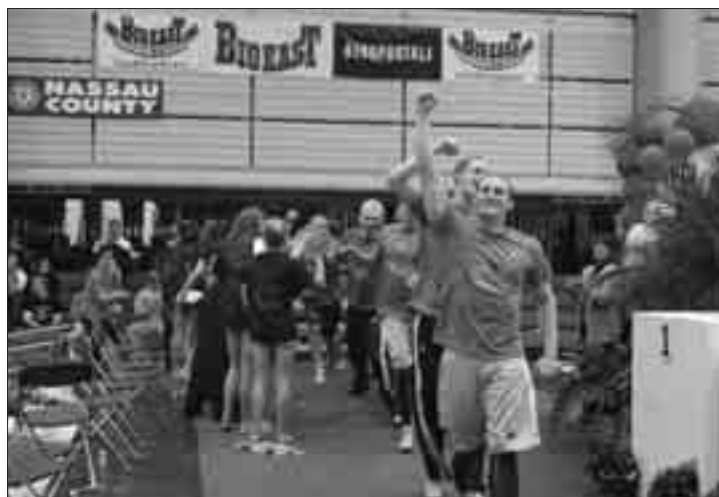
The Notre Dame men's swimming and diving team won its first BIG EAST championship in 2005, dethroning eight-time defending champion Pittsburgh.

1995, 1996, 1997, 1998, 2000, 2001, 2002, 2004