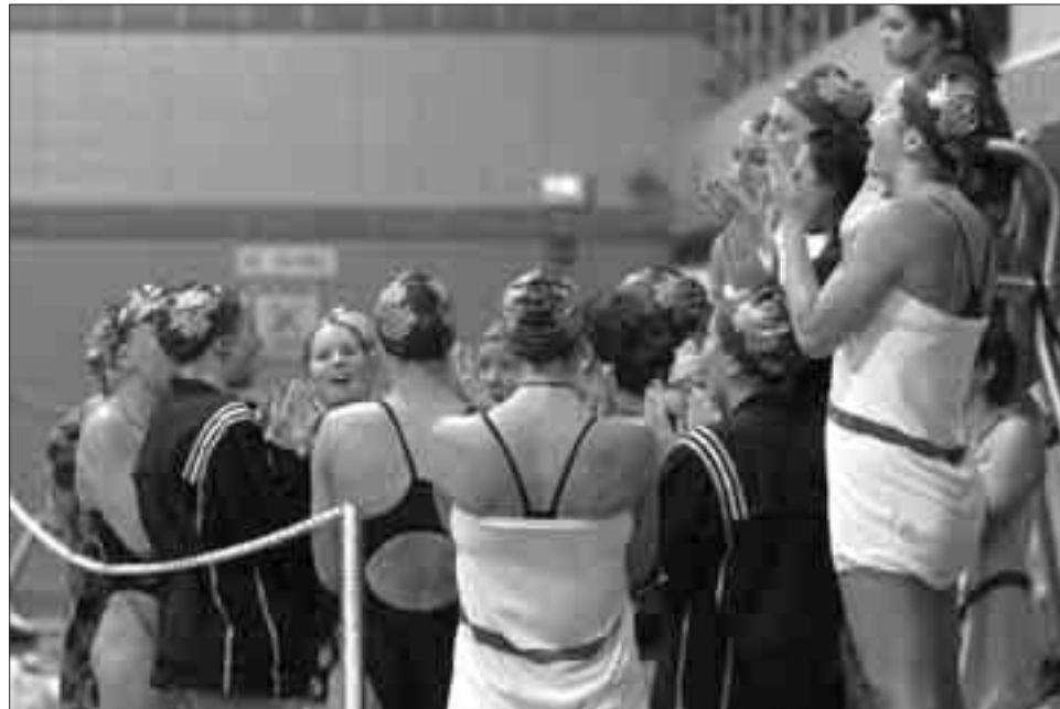
The 2004-05 team saw three school records fall during the season, including the 800 freestyle relay record at the BIG EAST Championships.