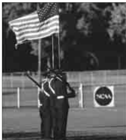
The Notre Dame women's soccer teams have played at Alumni Field since 1990. Located in the southeast corner of campus, it is one of the finest collegiate soccer venues in the Midwest with a seating capacity of 2,500. A press box was added in 1996.