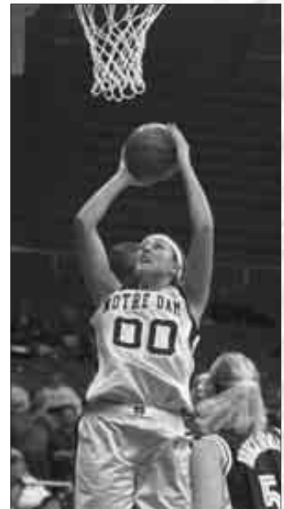
All-America center Ruth Riley posted the best single-season field goal percentage in school history, shooting .683 in 1998-99.