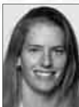
Head Coach Kim Barnes Arico