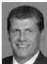
Head Coach Geno Auriemma