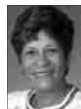
Head Coach C. Vivian Stringer