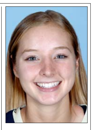
Career Highs Points Career.........18 vs. Syracuse (1/20/07)

Assists Career......9 vs. St. John's (1/16/07)