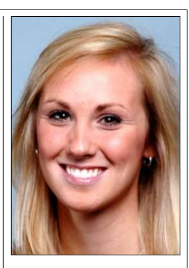
Career Highs Points Career.... 3, twice (MR: vs. Michigan, 12/2/07)

Rebounds Career....2, three times (MR: vs. St. Francis, 12/29/07)