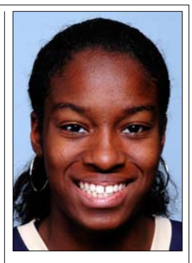
Career Highs Points Career....14 at Bowling Green (12/5/07)

Rebounds Career.... 8, three times (MR: vs. St. Francis, 12/29/07)