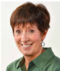
Muffet McGraw Karen & Kevin Keyes Head Coach 33rd Season at Notre Dame 38th Overall as Head Coach